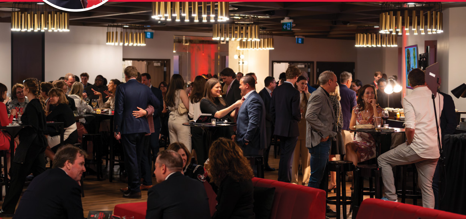
Photo: A full house for a shared vision