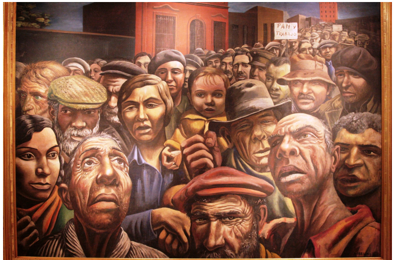
Antonio Berni, Manifestación , 1934. © Museo de Arte Latinoamericano, Buenos Aires. Berni is considered the “father” of political art in Argentina.

In the event of unexpected class cancellations, the instructor will post such notice on OWL. Please check regularly.