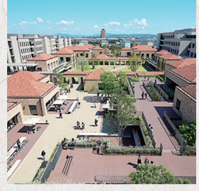
Gotenyama Campus Global Town