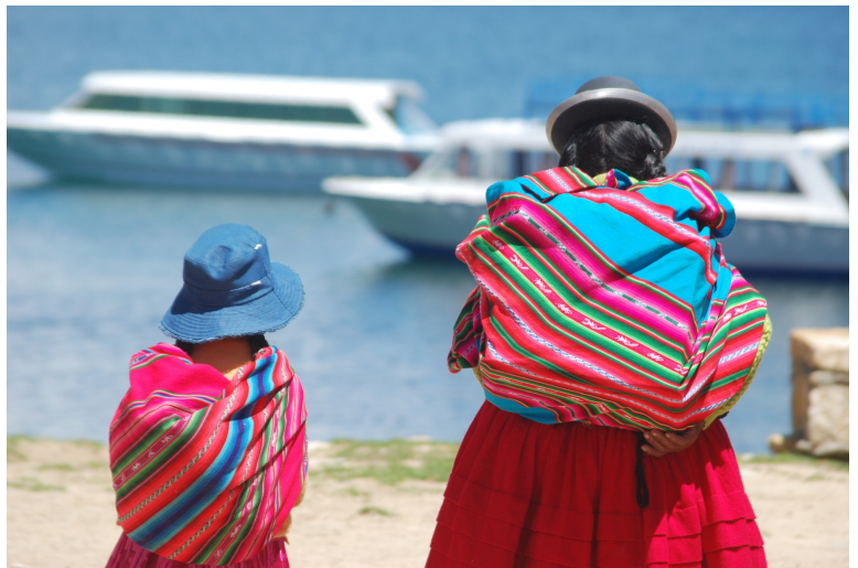
Images included in this course outline are from Pixabay.com and are released under a Creative Commons CCO license.