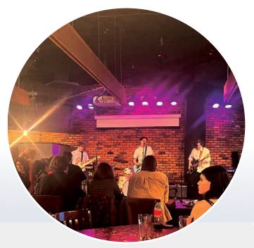
Canada's first UNESCO City of Music