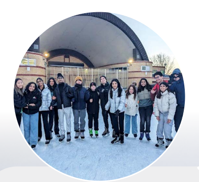
One of Canada's fastest growing cities