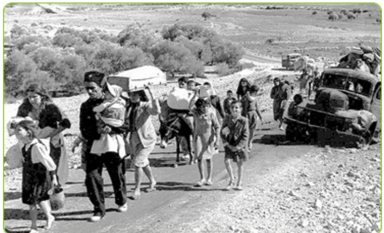
Stateless Palestinian refugees (1948)

“It is said that the history of peoples who have a history is the history of class struggle. It might be said with at least as much truthfulness, that the history of peoples without history is a history of their struggle against the state.” Pierre Clastres, Society Against the State