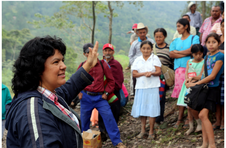
Berta Cáceres campaigned to preserve her people's environment, threatened by a hydroelectric project in Honduras. She was murdered in 2016.